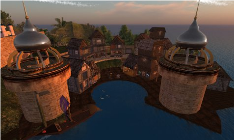
Der kleine Hafen von Port RarIR bei „Sonnenuntergang“ in Gor/Secondlife .