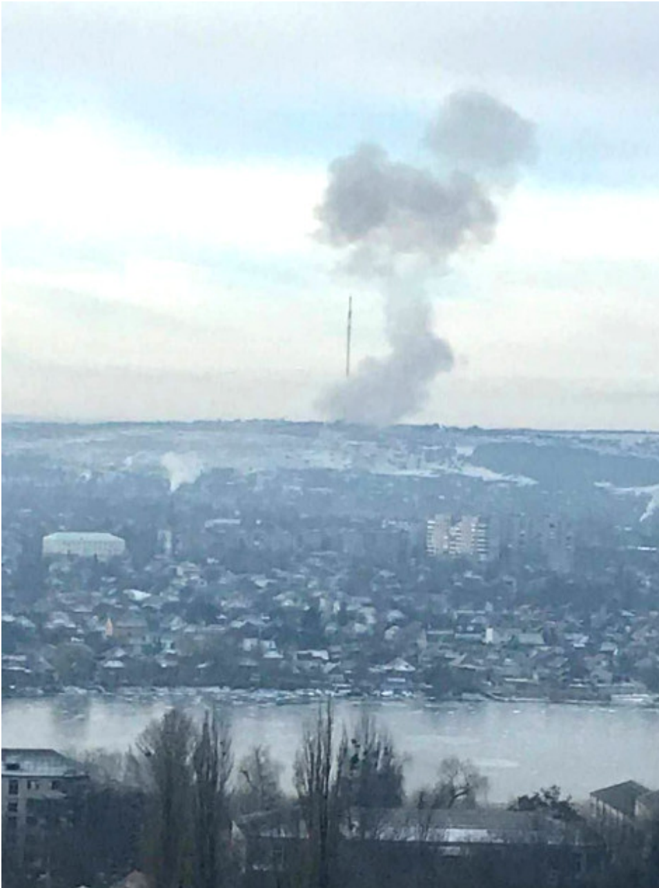
Russische Bombenangriffe auf Kramatorsk