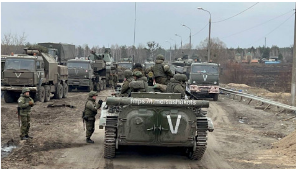
Трафик на подступах к Киеву, как в Москве в час пик.

The question for Western leaders is how to ensure Putin is defeated while nevertheless providing him with a route out of the crisis and avoiding any missteps that could lead to a wider conflagration. The path along the cliff edge is precarious. (...)